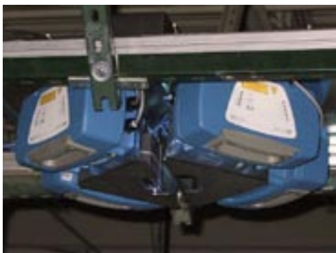
Image Captions: (TOP LEFT) Four AXIOMs provide omni-directional scanning. WiFi device is visible center of photo. (TOP RIGHT) Dual "X" scanning pattern. (LEFT, BELOW) Scanning array mounting.

© 2005 Accu-Sort Systems, Inc. All rights reserved. The ACCU-SORT logo, logotype, AXIOM, AXCESS and 1-800-BAR-CODE are trademarks or registered trademarks of Accu-Sort Systems, Inc.